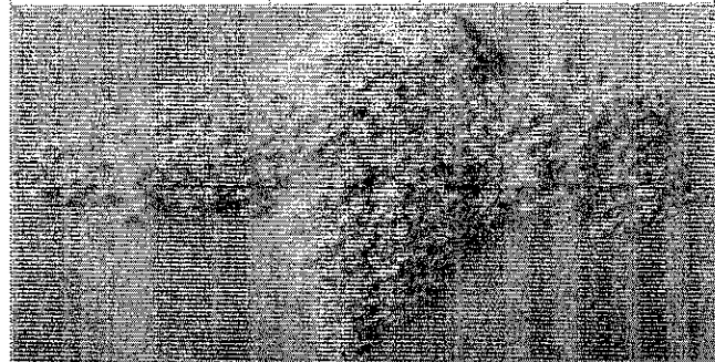
R-E-D 105 on white printer paper